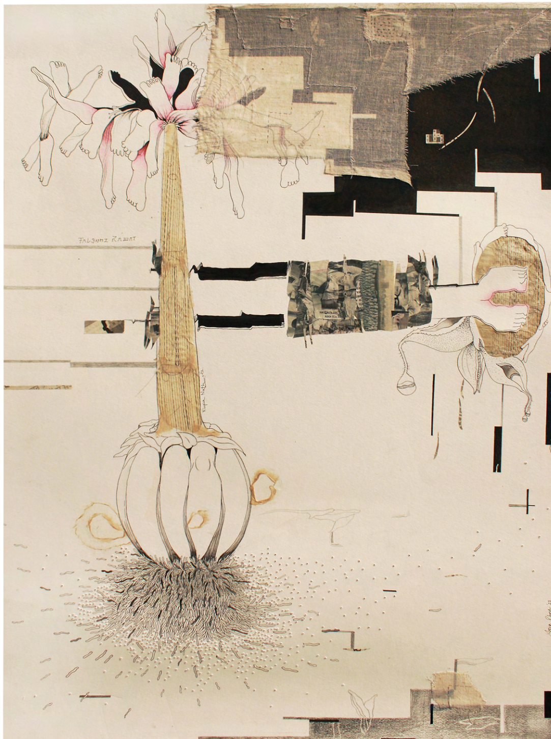
TITLE : THREE SIZE : 30" * 22" MEDIUM : MIXED MEDIA ON PAPER YEAR : 2021