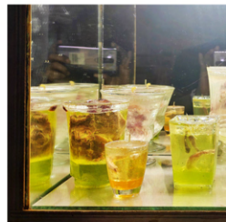
(Right side of the green candle's intestine turning black and red dot is appeared at the side of left green candle)