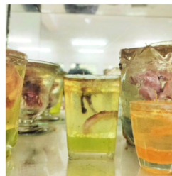
(the inner meat of green candle becomes more blackish than before and behind it, the left side of that glass candle containing raw meat turns out to be more pigmented)