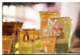
(Not much changes is seen, the condition of the object is intact)