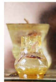
(meat which is casted in the glass container turned out to be more pigmented day by day)

Hence, I learned that resin casting is effective to preserve meat for a long period of time if it is casted in a plastic container rather than glass and there should be no air bubbles. I experimented with white meat.