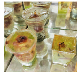
(slite melt of epoxy is seen on the top of the glass candle, while blood clot is seen on the top of these three candles)

'Candles' on 21/10/2021 (after one year)