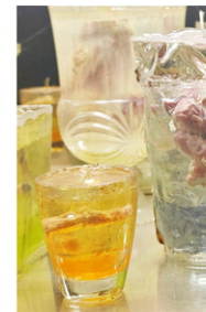
(the flow of redness is seen at the side of that blue candle placed beside the orange candle)