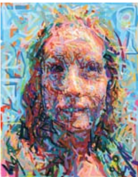
Colleen , 2013, acrylic on panel, 11 x 14 in.