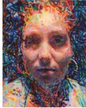
Nicole , 2013, acrylic on panel, 11 x 14 in.