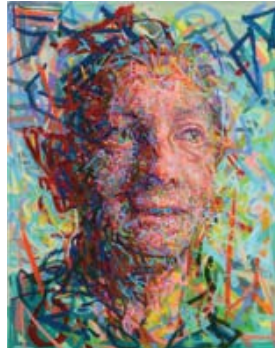
Chandler , 2013, acrylic on panel, 11 x 14 in.