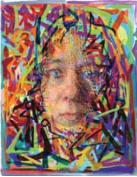
Mary Beth , 2013, acrylic on Yupo mounted on panel, 11 x 14 in.