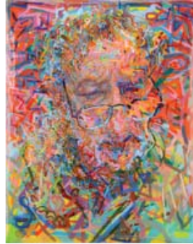
John , 2013, acrylic on panel, 11 x 14 in.