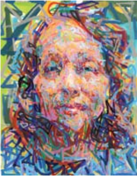
MJ2 , 2013, acrylic on panel, 11 x 14 in.