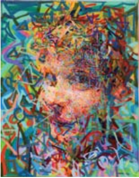
Megan , 2013, acrylic on panel, 11 x 14 in.